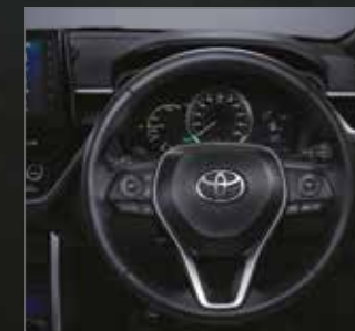
Elegant Steering Wheel Design. Embellished with silver chrome details to give a more prestigious experience when commanding the road. (All Type)