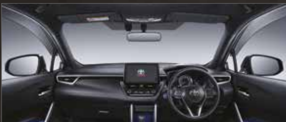
Classy Interior Design With elegant black color and silver chrome details placed meticulously to further enhance the luxurious feeling on the inside of the car. (All Type)

Ensures precise handling and agility to facilitate comfort ride experiences.