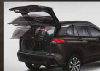
Automatic Power Back Door. Equipped with kick sensor feature to make it more convenient when loading into the trunk. (HV Type)

Hybrid engine and battery power work seamlessly to enhance a smooth driving experience and maximum performance to let you conquer every journey.