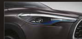
Sharp Headlamp Design. Enhancing the sleek yet premium look of the front part of the car. (HV Type)