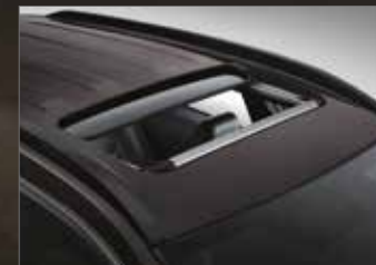
Power Moonroof. Providing sufficient lighting in the cabin to give a spacious feeling. (All Type)