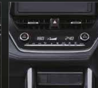
Dual Zone With Auto Function Convenient AC adjustment as the driver and passengers preferences. (All Type)