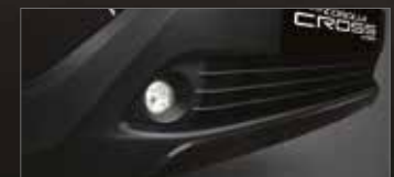
Beaming LED Foglamp. Giving a solid visibility for a comfortable and safe driving experience. (All Type)