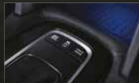
Advanced Drive Mode. Enjoy the journey as you experience ECO, Sport or EV. (HV Type)