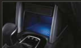
Illuminating Console. Not only providing a luxurious addition to the interior but also giving better visibility to the center console. (All Type)