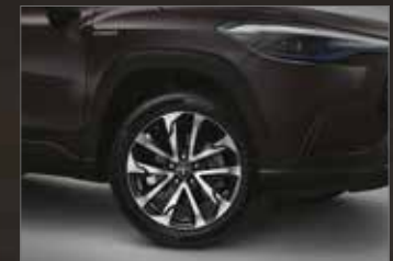
18" Alloy Wheel. New design with machining and dark grey chrome color providing a more urban look. (All Type)