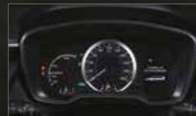
Detailed MID and Combi Meter Design. With digital MID for a more comprehensive outlook on the vehicle's status. (HV Type)