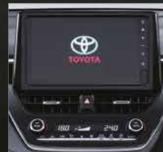
Multi-Purpose Head Unit. New 9" Display with AM/FM Stereo, Bluetooth, Miracast, NFC and Voice Command.