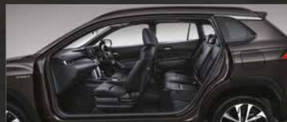
Comfortable Cabin Space Designed and calculated flawlessly to give a decent leg room and high ceiling for an enjoyable driving experience. (All Type)