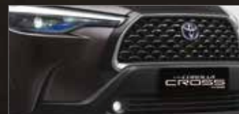
Bold Front Grille Design. With double trapezoid shape on the grille to highlight the toughness element of the car. (All Type)