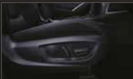
Electric Power Seat. An easy 6-way position adjuster for the driver to aim for the best convenient position. (HV Type)